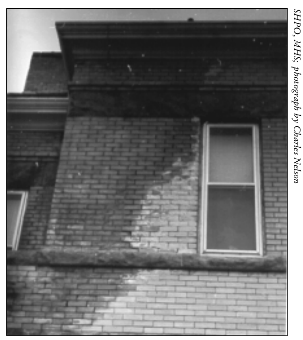
This photograph shows damage to mortar and masonry caused by a leaking gutter.

this reason, test areas should be required about a month prior to the actual repointing project. In Minnesota's climate, repointing should be done before October 15th to allow adequate curing time before a hard freeze (unless the area is heated).