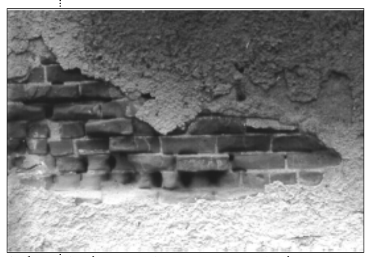
Surface coating that traps moisture can cause extensive damage to masonry.

Once a problem is identified, remedial work usually requires a professional, not a "do-ityourselfer." Patching repairs require the total removal of deteriorated materials down to a sound substrate. For narrow cracks, a slurry of water and cement can be applied as filler. However, if the cracks are the result of settling, an elastic sealant must be used. Large areas require a patch of cement and sand to allow adequate compacting and bonding. If the patch is deep, several layers may be required. Care must be taken to assure that exposed reinforcing members are totally covered. It is highly likely that the concrete patch will not match the historic material; if repairs are extensive, it may be necessary to paint the surfaces with a special masonry paint for aesthetic reasons. (For further information, refer to Preservation Brief #15: Preservation of Historic Concrete: Problems and General Approaches.)