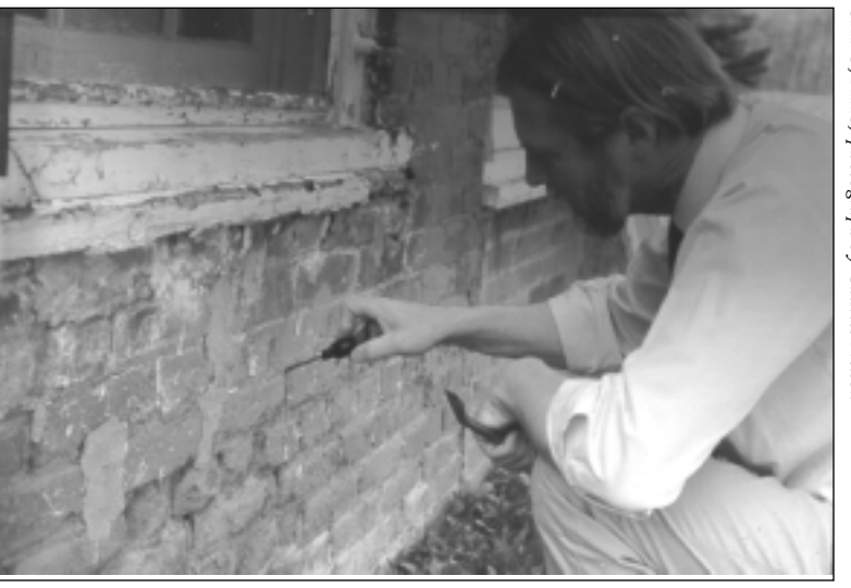
The author points out water-caused deterioration of these mortar joints, and the inappropriate use of Portland cement patching mortar.

The most common point of entry for water is the mortar joint. Mortar bonds the units together; it must be strong enough to maintain this bond, but it also must be flexible enough to allow the structure to "breathe" in response to natural temperature fluctuation. Wind and rain cause erosion of the mortar, exposing sand aggregate. Continual erosion results in the receding of the mortar, resulting in open penetrations into the wall. When water enters these openings, it may saturate the interior and may freeze. When water freezes, it expands, driving the joint