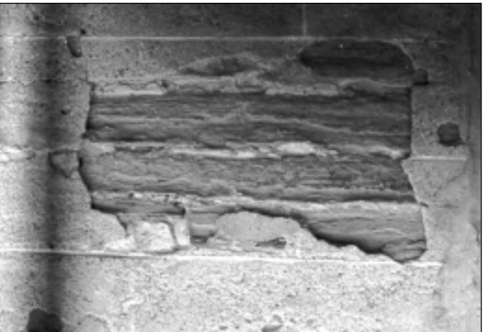
Stucco applied to limestone has trapped moisture in the wall. Freezing caused the stucco to loosen and break away, taking bits of the stone with it.

Many concrete and tile buildings have stucco applied to their exteriors. Stucco is a two-or-threepart, plaster-like coating that is applied directly onto masonry or over wood or metal lath in frame construction. Though it is considered a protective