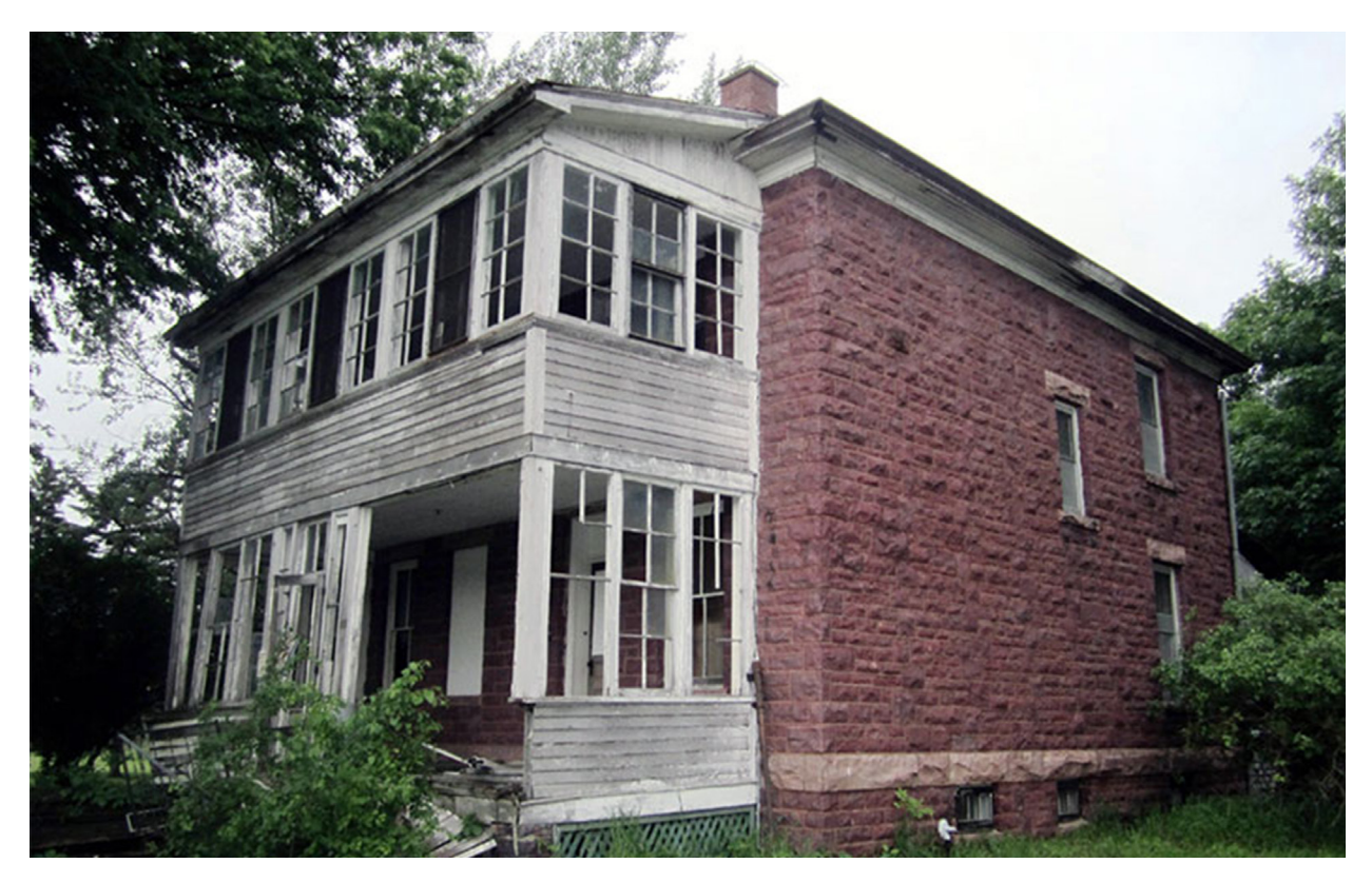
The exterior of the Pipestone Indian Boarding School Superintendent's Residence, built in 1907