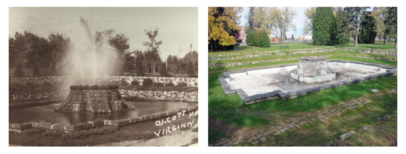
Photos of the Olcott Park Fountain and Rock Garden in the 1930s and today