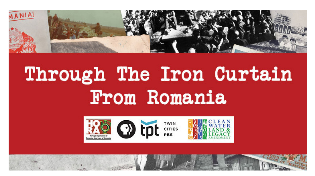
The documentary Through the Iron Curtain - From Romania aired on Twin Cities Public Television on Nov. 5, 2017 and is available to view on tpt.org