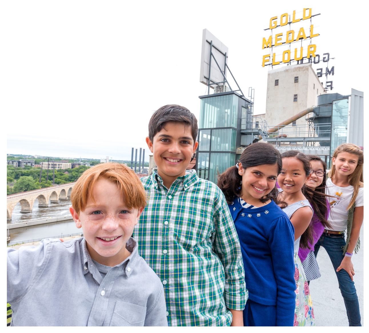
The ACHF supports several statewide educational initiatives, including the Legacy Field Trip Support Fund, which provides financial assistance to schools to offset the high cost of field trip transportation

The Minnesota Historical Society has been preserving, sharing, and connecting people with history since 1849. With support from the Legacy Amendment's Arts and Cultural Heritage Fund, the people of Minnesota are investing $11 million this biennium in history programs that will bring the power of history to Minnesotans of all ages in all corners of the state.