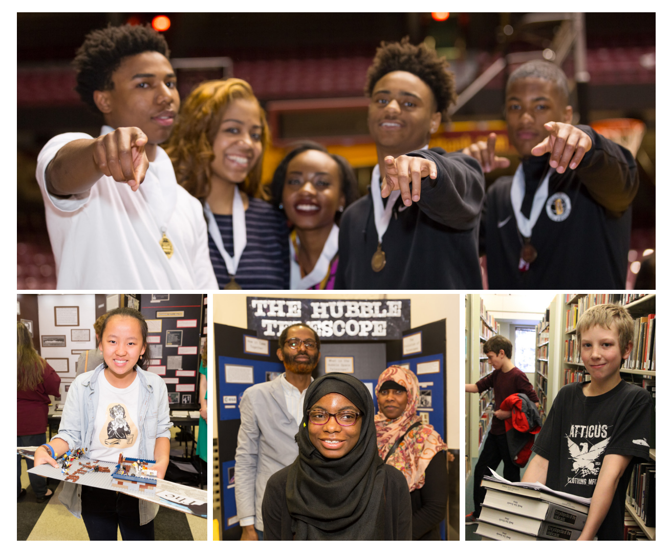
The ACHF supports National History Day outreach around Minnesota, including undergraduate students mentoring middle and high school History Day students

Funding from the Legacy Amendment's Arts and Cultural Heritage Fund has resulted in partnerships between the Minnesota Historical Society and more than 30 organizations. It also supports the Heritage Partnership Program that works to build capacity of two or more independent organizations to preserve and enhance access to Minnesota's history and cultural resources, by supporting the creation and development of sustainable, history-based partnerships throughout the state.