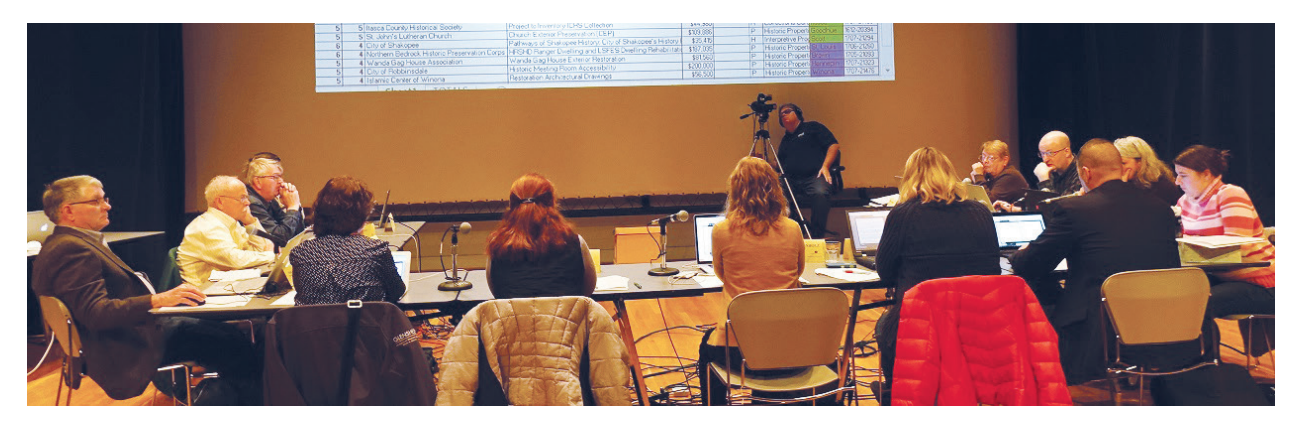
A Historic Resources Advisory Committee (HRAC) meeting at the Minnesota History Center

The ACHF-funded Minnesota Historical and Cultural Heritage Grants Program provides a valuable opportunity for nonprofit and educational organizations, government units, and tribal organizations across Minnesota to preserve and share the state's history and cultural heritage.