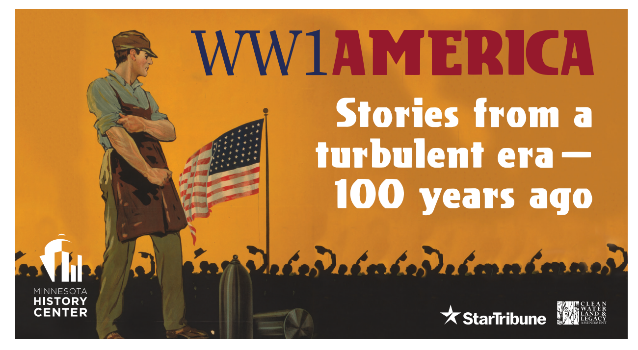
The WW1 America exhibit ran at the Minnesota History Center from April 8-Nov. 11, 2017