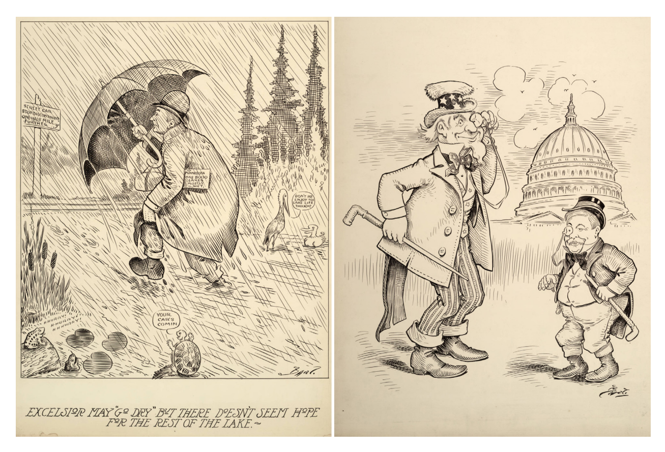
Editorial cartoons by Charles Lewis "Bart" Bartholomew that appeared in the Minneapolis Journal, contributed to the Minnesota Digital Library by Gustavus Adolphus College

The Minnesota Digital Library (MDL) is a statewide, multi-institutional collaboration that supports discovery, education, and personal enrichment through digitization of and access to the rich historical resources of the state's public and academic libraries, archives, museums, and historical societies while also preserving these resources for future generations.