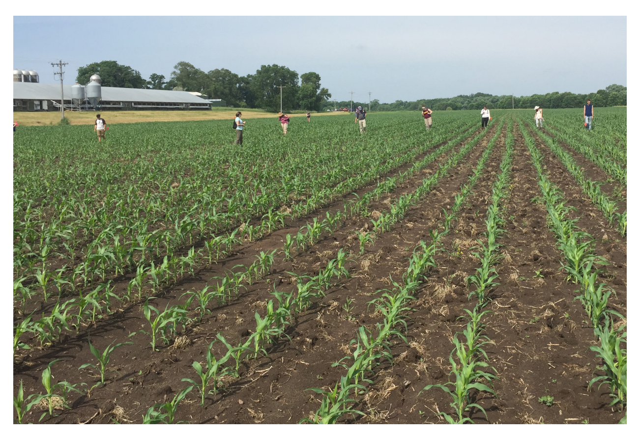
A field crew works on an archaeological survey of Dakota County.

The Legislature created the Statewide Survey of Historic and Archaeological Sites to provide opportunities to expand our understanding of historic and archaeological sites statewide.