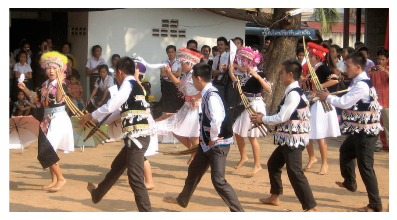
Dancers and Qeej players performing from a Hmong Cultural Center exhibit panel on the Qeej, a traditional instrument.