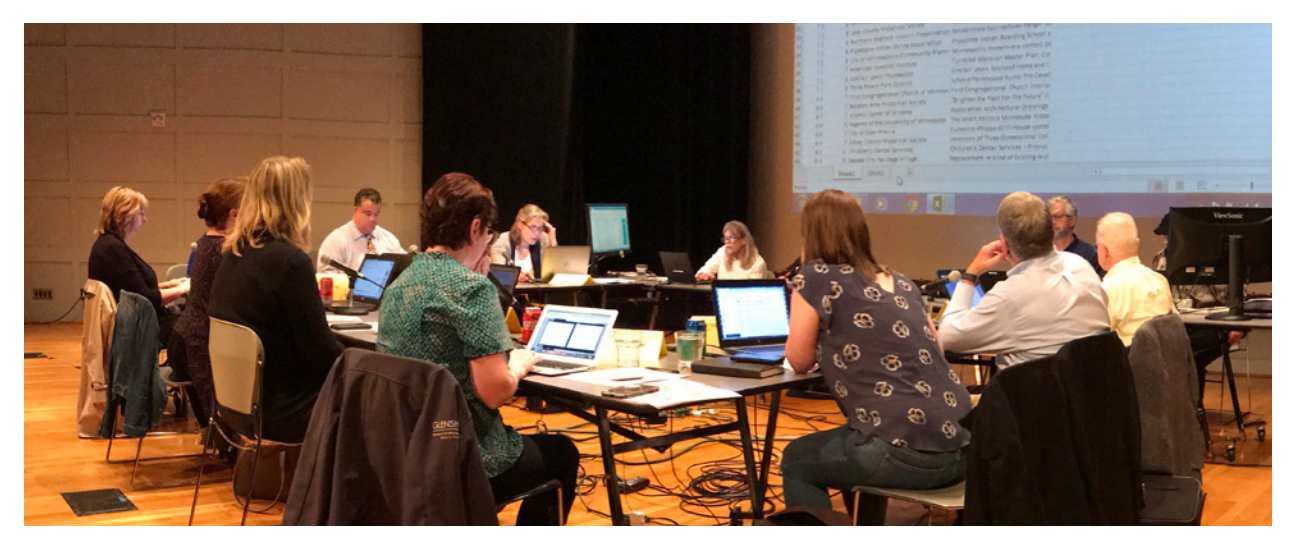
The Historic Resources Advisory Committee (HRAC) meeting at the Minnesota History Center.

The ACHF-funded Minnesota Historical and Cultural Heritage Grants Program provides a valuable opportunity for nonprofit and educational organizations, government units, and tribal organizations across Minnesota to preserve and share the state's history and cultural heritage.