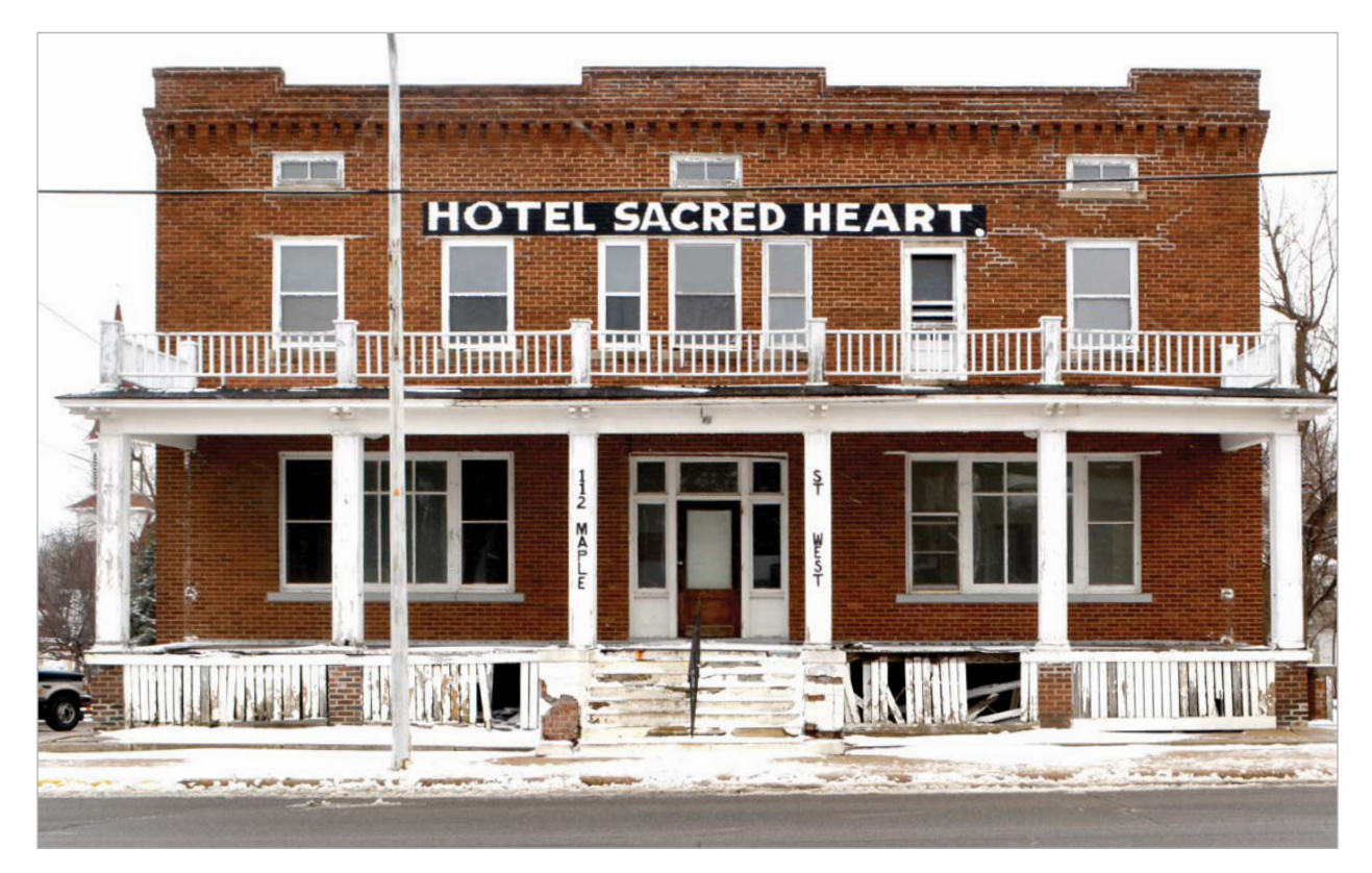
The Hotel Sacred Heart was built in 1914, and the Sacred Heart Area Historical Society is currently working to restore it.