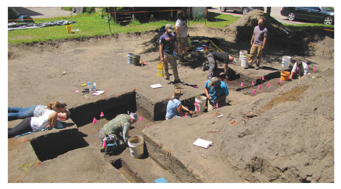
St. Cloud State University faculty and students conduct excavation work at the site of Fort Fair Haven.