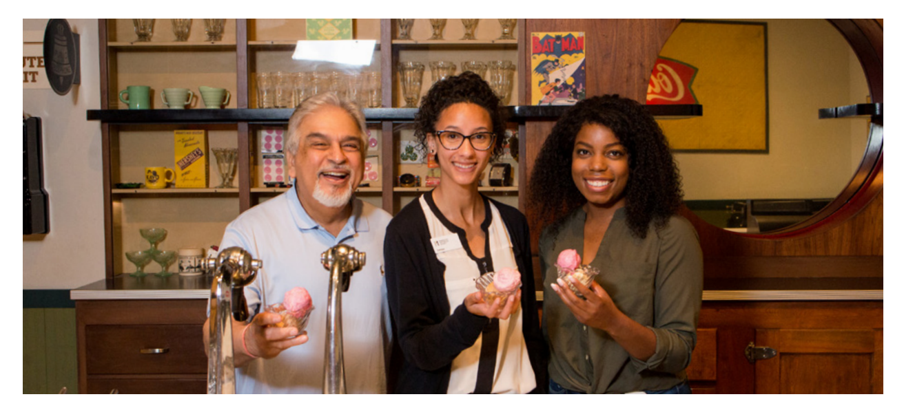
The House of Memories program uses museum resources to help those living with dementia and their caregivers.