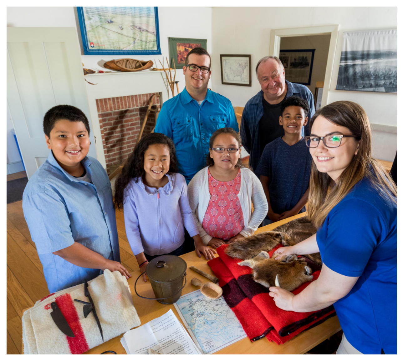
The ACHF supports several statewide initiatives, including reimagining Historic Fort Snelling programming as MNHS works to revitalize the historic site.

The Minnesota Historical Society has been preserving, sharing, and connecting people with history since 1849. With support from the Legacy Amendment's Arts and Cultural Heritage Fund, the people of Minnesota are investing $11 million this biennium in history programs that will bring the power of history to Minnesotans of all ages in all corners of the state.