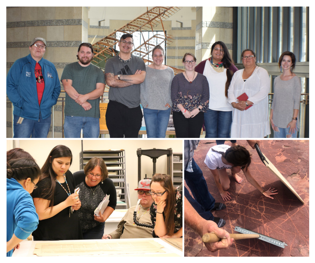
In summer 2018, eight Native American undergraduates participated in the American Indian Museum Fellowship at MNHS.

Funding from the Legacy Amendment's Arts and Cultural Heritage Fund has resulted in partnerships between the Minnesota Historical Society and more than 20 organizations. It also supports the Heritage Partnership Program that works to build the capacity of two or more independent organizations to preserve and enhance access to Minnesota's history and cultural resources, by supporting the creation and development of sustainable, history-based partnerships throughout the state.